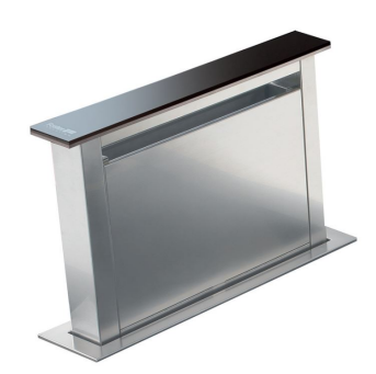
Hood S4000 Domino Ghost 2451 000