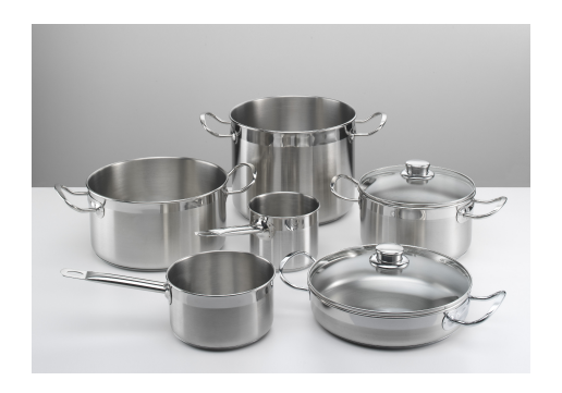
Induction Pro - Cookware set -8pcs 8210 008