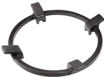
Cast iron wok support 9601 727