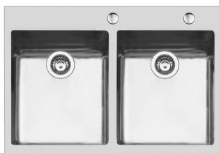
Sink KE Filotop 2269 050