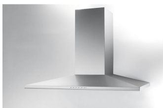
Hood Amélie 2447 090