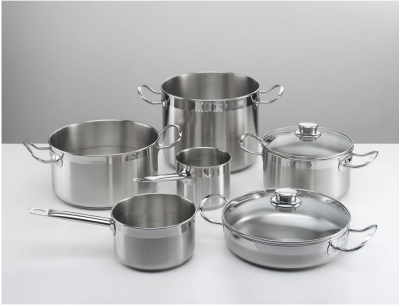
Induction Pro - Cookware set - 8pcs 8210 008