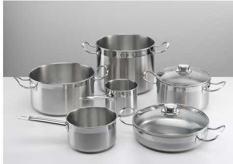
Induction Pro - Cookware set - 8pcs 8210 008