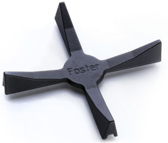
Cast iron wok support 9601 668