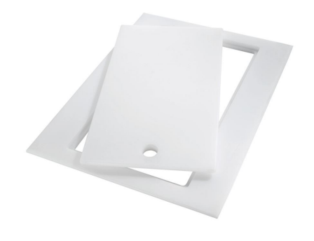
HPDE Twin chopping board 8644 101