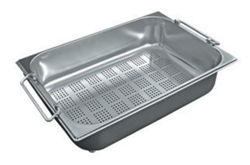
Stainless steel colander 8154 000