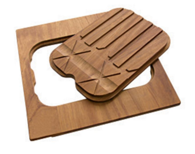
Iroko-wood twin chopping board 8644 004