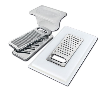
Graters kit with ring-holder and food collection tray 8159 101