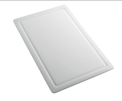
HPDE Chopping board 8657 001