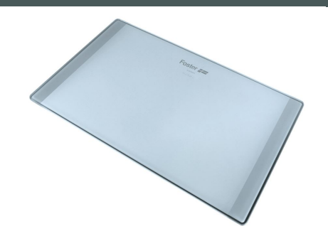
Glass chopping board 8633 300