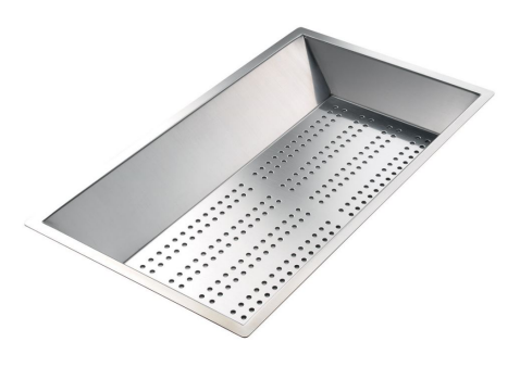
Stainless steel perforated tray 8151 000