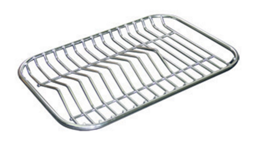
Stainless steel plate rack 8100 154