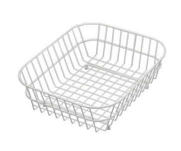
Cestello inox 8612 000