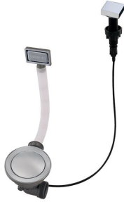
Space automatic waste fitting 8407 108