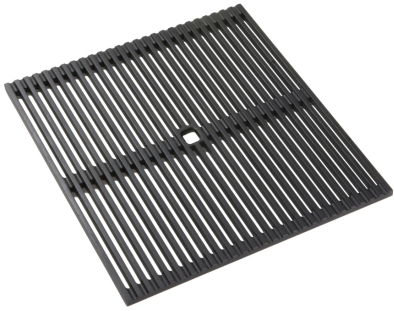
Black grid 8100 600