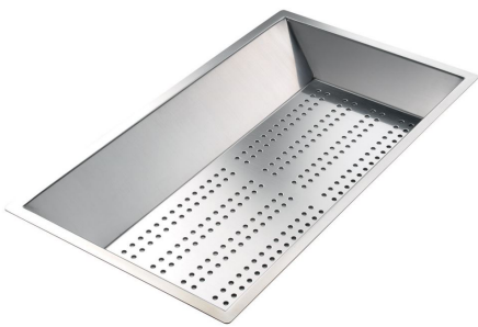
Stainless steel perforated tray 8151 000