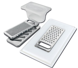
Graters kit with ring-holder and food collection tray 8159 101