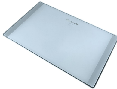
Glass chopping board 8633 300