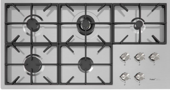
Cooker hob Foster Milano 7648 000