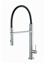
Mixer Tap Tube 8477 100