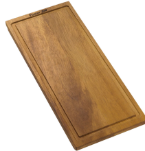
Walnut-wood chopping board 8642 000