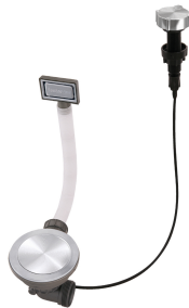
Space Milano automatic waste fitting 8407 115